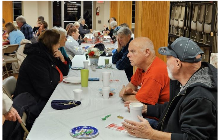
Food & Fun regulars. Note: the table is full to the other end!