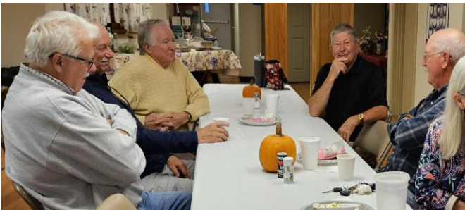
Chatter Box men?